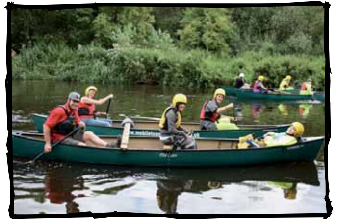
Below: YAG members loving the Lagan.